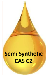
Semi Synthetic CAS C2