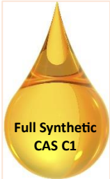
Full Synthetic CAS C1

Our Compressor oil are high-performance synthetic oils designed to meet the stringent requirements of DIN 51506 VDL. Our careful selection of synthetic base stocks provides outstanding oxidation resistance allowing for extended drain intervals of up to 4000 hrs.