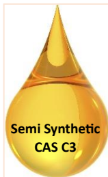
Semi Synthetic CAS C3